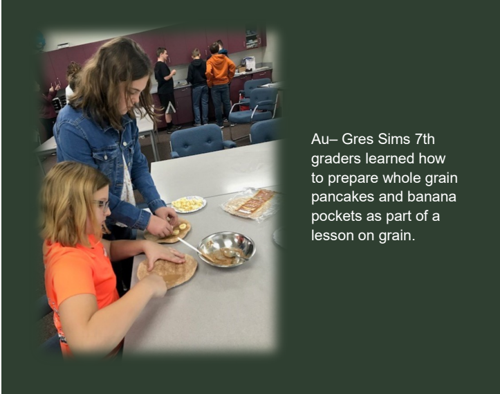
Au– Gres Sims 7th graders learned how to prepare whole grain pancakes and banana pockets as part of a lesson on grain.