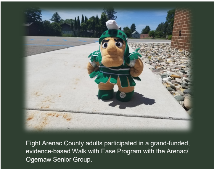
Eight Arenac County adults participated in a grand-funded, evidence-based Walk with Ease Program with the Arenac/Ogemaw Senior Group.

MSU Extension/MI Sea Grant partner(s) with and supports Au Gres-Sims School District's place-based education efforts through the Northeast Michigan Great Lakes Stewardship Initiative. 124 students participated in these projects , which include building a rain garden for filtering pollutants in stormwater, studying biodiversity on Big Charity Island, investigating the Au Gres River and more! 175 Standish-Sterling High School students explored macroinvertebrates and how they serve as live water quality indicators in a freshwater ecology program supported by MSUE/MI Sea Grant. They compared macroinvertebrates in Saginaw Bay with an inland lake to compare biodiversity and evaluate the water quality.